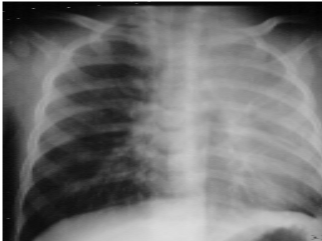
Figure-1: X-ray chest showed complete non homogenous opacity of left hemi thorax with compensatory hyperinflation of right lung, shifting of mediastinum to left side with no apparent evidence of foreign body.

of mediastinum to left side with no apparent evidence of a foreign body. During this recent episode, he was treated with Inhaled nebulizers and intravenous antibiotics. Child responded well clinically despite having persistent radiological findings on repeat chest X-ray. Therefore, C-T scan chest was planned that showed (Figure-2) unilateral hypoplasia of the left upper lobe with compensatory hyper-expansion of right lung and no evidence of foreign body.