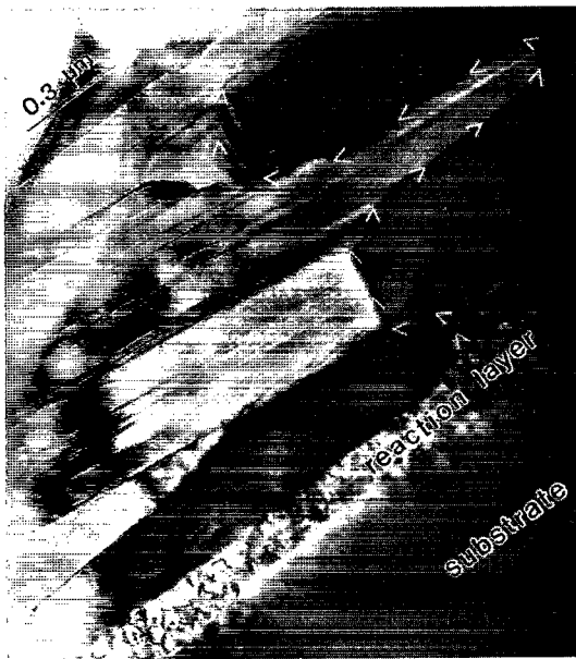
FIG. 2. TEM cross-section image showing the substrate, a thin reaction layer, and tilt (perpendicular to the substrate) and twist (parallel to the substrate) grain boundaries. As indicated by the arrows, tilt boundaries tend, in combination with short segments of twist boundary, to extend over several grains. The thin area in this view covers about half the sample thickness.

c axis). The data were obtained using a wide x-ray beam sufficient to illuminate all or most of the area of a current tab ( 4 \times 8 mm). The intensity distribution consists of several peaks superimposed on an average intensity which is well above background. These data suggest that basal plane orientations of grains are largely random, but that there is a tendency for clustering about several specific directions. This result is consistent with previous EBSD measurements of the orientations of a large number of grains at random locations. However, a very different intensity distribution was obtained when a narrow x-ray beam was used, indicating that locally grains are far from randomly oriented. Figure 1(b) shows an azimuthal scan of the (10\bar{1}0) reflection obtained with a narrow beam which had a projected area on the sample of \sim 0.5 \times 1 mm. The intensity distribution shows two strong peaks with a low intensity (near background) at all other angles, indicating that basal plane orientations for grains within the illuminated area cluster strongly about only two directions. For approximately 20 such local scans obtained on separate areas of two different deposits, the number of peaks ranged from 1 to 5. These results indicate that, although over the whole deposit many basal plane orientations occur, there is a high degree of local texture indicative of the presence of colonies of grains with similar orientations.