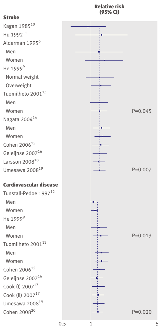
Fig 3 | Cumulative meta-analysis. Evaluation of time trends (year of publication) in relation between habitual sodium intake and risk of stroke or cardiovascular disease

male and female cohorts suggest that the associations are consistent and not significantly different between the sexes. Similar results were obtained with respect to the method of assessment of habitual sodium intake used in the various studies.