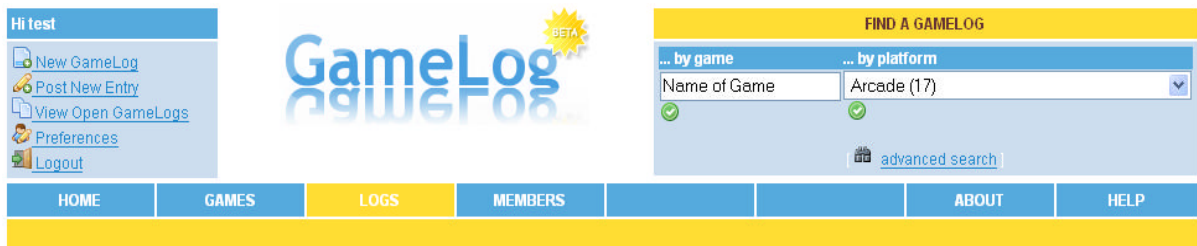
Figure 2: GameLog Site Navigation Bar

For ease of use and navigation, GameLog uses a general navigation bar that is available on all of the site's pages (see Figure 2). The left-hand side contains direct links to most of the functions that a user who is logged in will require such as creating a new GameLog, writing an entry for an existing log, seeing all of the GameLogs that are currently active, changing their preferences, and logging out. On the right-hand side, the site has features to allow users to quickly search for GameLogs for specific games or platforms. Below this, there are links to each of the main parts of the site. In order from left to right, these are the: (1) Games page, where users can see a list of all the games currently registered in the system, (2) Logs page, where users can see a list of all the GameLogs on the site, (3) Members page, where users can see a list of all of the sites users, (4) About page, which has some basic information regarding the purpose and history of the site, and (5) Help page, where users can find answers to commonly asked questions.