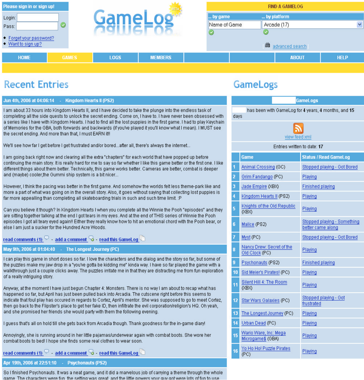
Figure 3: User's Home Page

Figure 3 shows the home page of a particular (anonymized) user. The column on the right side contains information on how long the user has been a member of GameLog, a link to an RSS feed of the user's entries and a list of all of the GameLogs that user has created on the site. The list of games is displayed in alphabetical order and also shows the current status of each GameLog. Additionally, it has links to a webpage for each game as well as the GameLog for each individual game. This last link is useful if someone wants