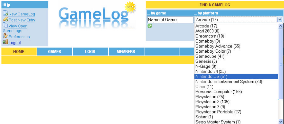
Figure 8: Search Options in Navigation Bar

For each GameLog created, the author of that GameLog can write new entries as well as update the status of each GameLog. Figure 9 shows an example of the interface a user sees for all of their open GameLogs (defined as GameLog's whose status is either "Playing" or "Played occasionally"). There are similar pages for seeing all of a user's GameLogs regardless of status and finished or closed GameLogs (defined as GameLog's whose status is not "Playing" or "Played occasionally"). Figure 10 shows the interface from which a user can set each GameLog's status to any of the following: "Playing", "Finished playing", "Stopped playing - Got Bored", "Stopped playing - Got frustrated", "Stopped playing - Technical problems", "Played occasionally", "Stopped playing - Something better came along". Additionally, it is possible to write a short opinion about each game as well as assign it a numerical rating ranging from one (abysmal) to five (excellent).