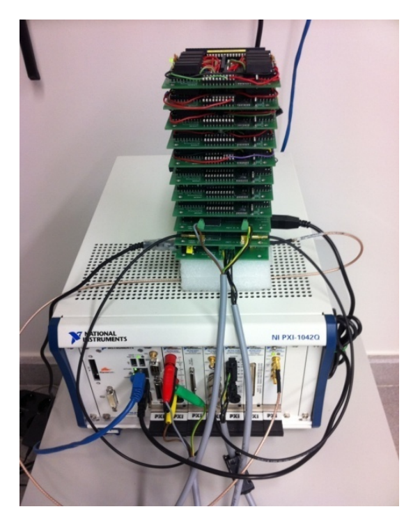
Figure 1. VISIR hardware platform at University of Deusto