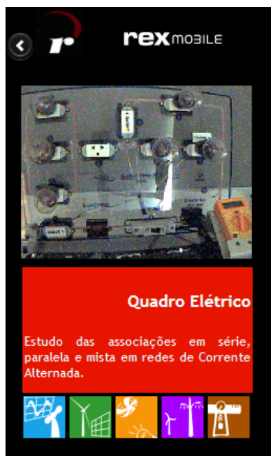
Figure 1. Screenshot of the Experiment Remote 'Electric Panel' in a Smartphone

shared with many other tasks. Inside the production for remote experimentation, it is essential to organize a mental model of data, functions and specific activities, in order for the student to understand and recognize these elements [8].