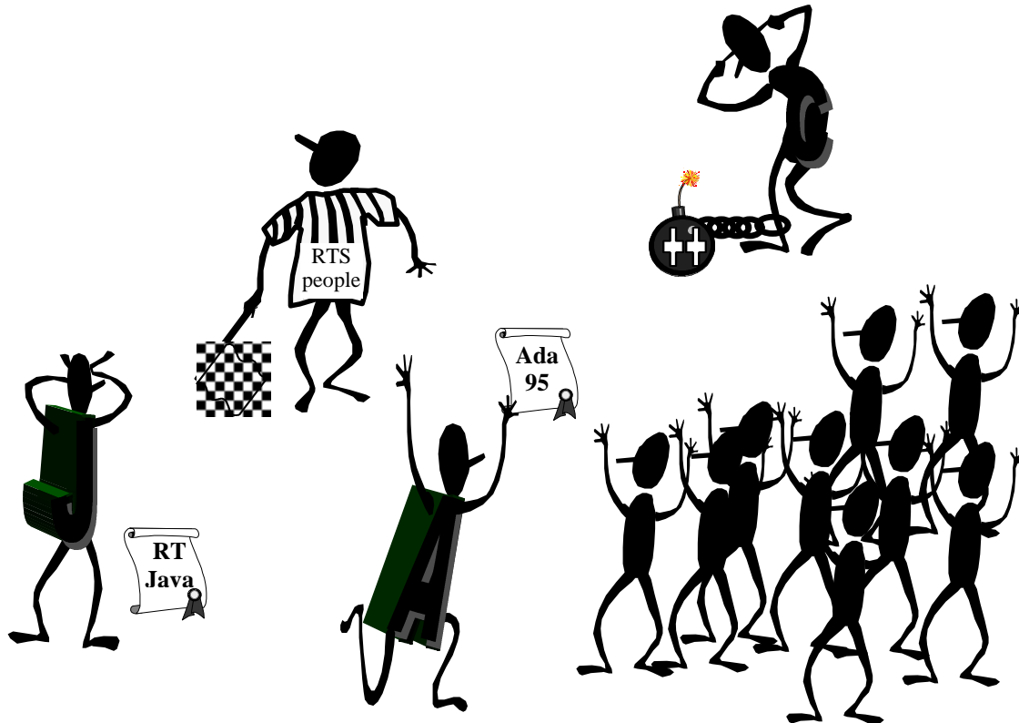
Figure 2 – The future

Another problem is the myth. Ada 83 had several drawbacks (compiler inefficiency, complexity) that prevented it from being widely accepted in the programming community. Java, on the opposite, is closely connected to the Web programming, and not too complex to learn, so it is extremely appealing to programmers.