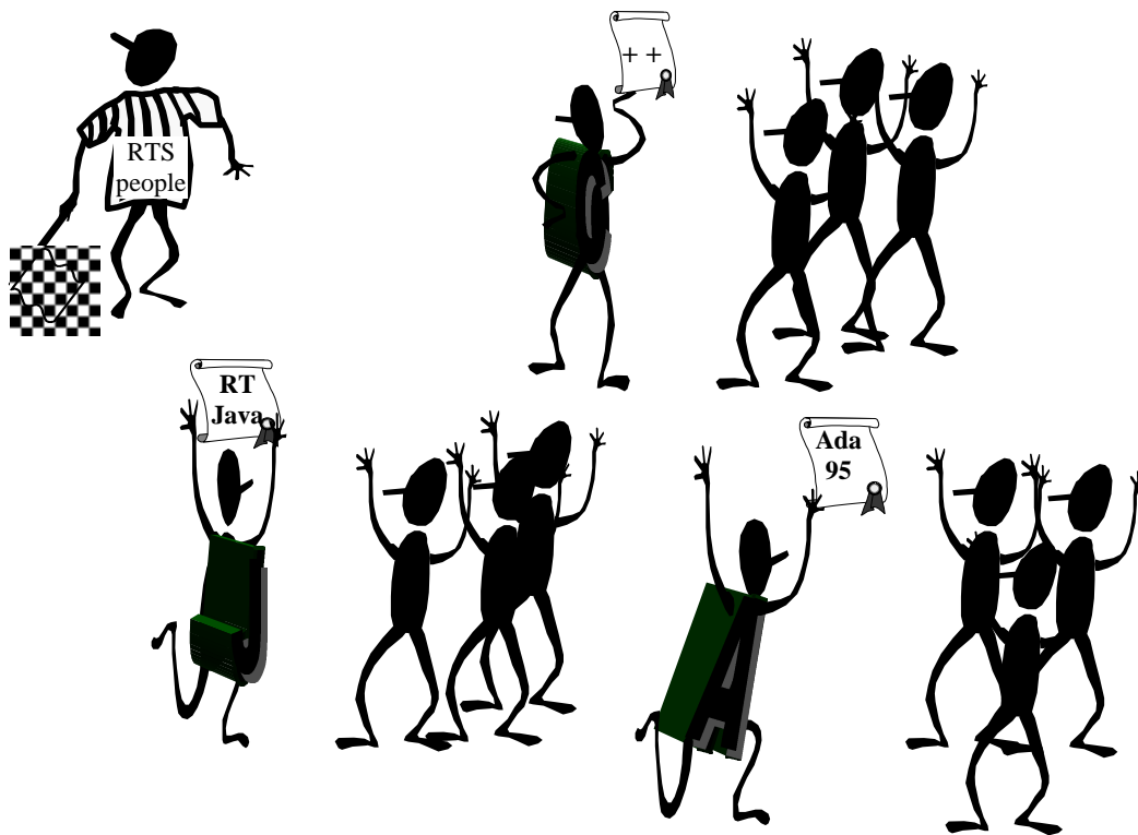
Figure 3 – The real future

Real-time systems include different broad areas, with different sets of requirements. In soft real-time systems with large dynamical evolution, such as multimedia or factory-level process control, Real-Time Java can, and probably will, take a major role. However, in systems with hard real-time requirements, where safety, reliability or availability are important concepts, Ada will continue to have a strong influence.