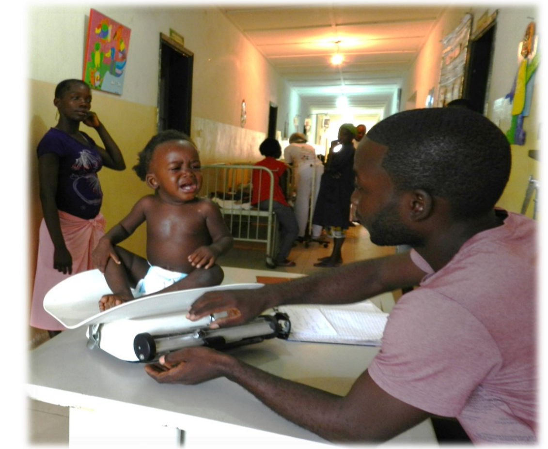
Fig-2— Pediatric Urgency Service at The BGH

This study aims to identify the most frequent pathogenic agents of diarrhoea in children under five attending the Bengo General Hospital (BGH).