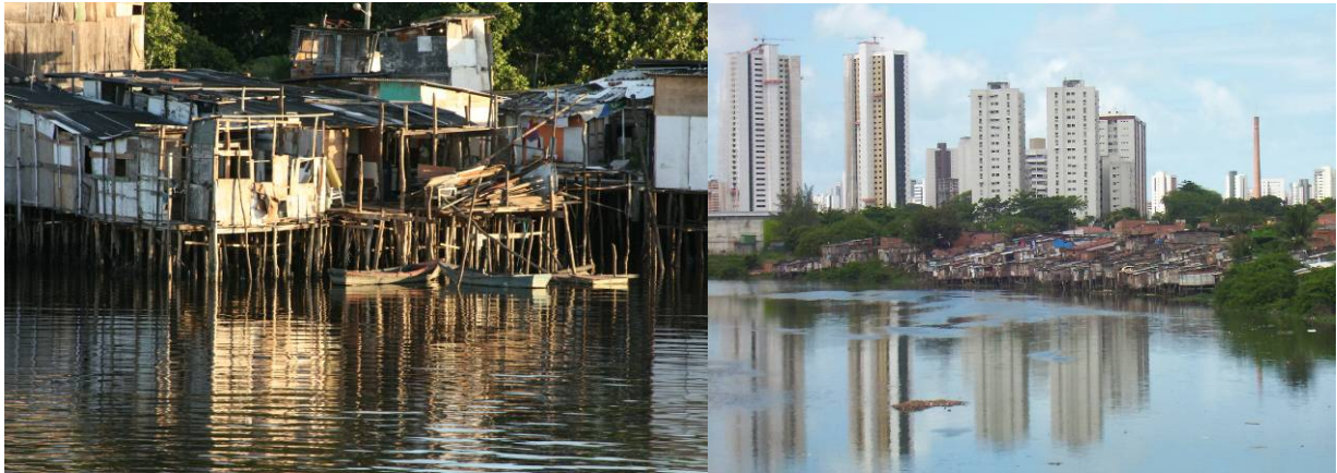
Figure 3; 4: Palafitas in the rivers banks of Capibaribe

water arrives to the taps each two days. Moreover, only 30% are connect to the used water evacuation net. Only 20% of this volume is treated, and the rest of it is rejected in rivers and canals without any treatment. The population perceives the river as an open air sewer that stinks and causes illnesses. Thus the city lives a paradox where the water is a major urban problem for its presence (polluted state) or for its absence (potable state).