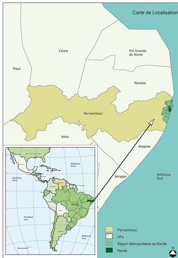
Figure 1: Localization plan