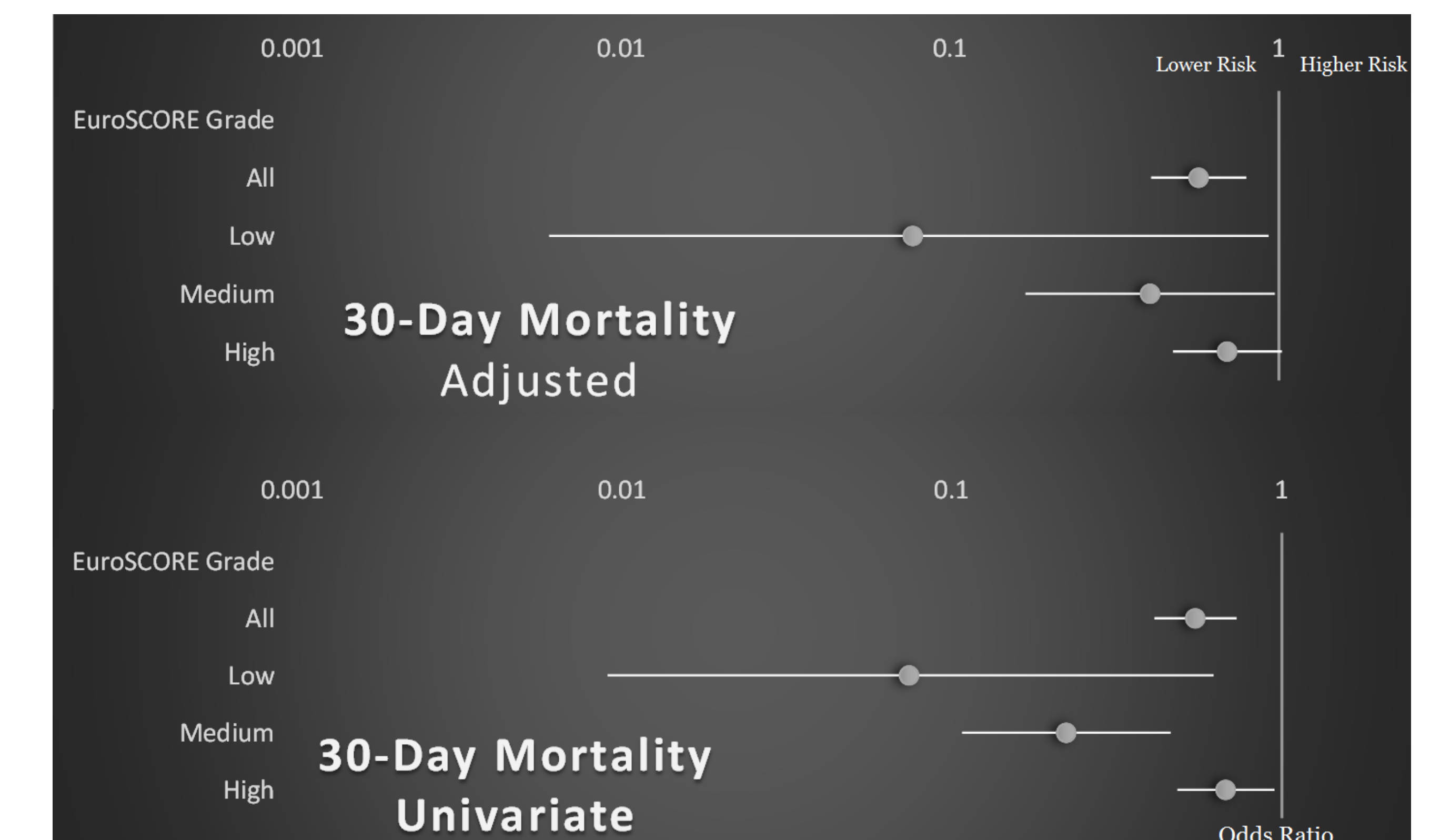
Figure 2. Effects of aspirin on 30-day mortality in patients with low, medium, and high EuroSCORE predicted operative mortality undergoing cardiac surgery.