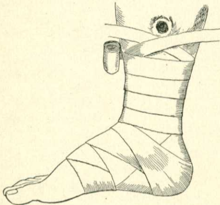
Fig. 51.—Strapping of ulcer of leg (after Liston).

Varicose veins demand either ligation at several points, excision, circumcision by Schede's method (page 329), or the continued use of a flannel roller or a Martin rubber bandage. Never operate on varicose veins if phlebitis exists, unless a clot has formed, in which case apply a ligature above the clot. Inflammation is met by rest, elevation, painting the neighboring parts with dilute tincture of iodine, and applying about the ulcer ichthyol ointment. For calloused edges , blister, employ radiating incisions, or cut the edges away. Ordinary thick edges should be strapped. In strapping use adhesive plaster and do not completely encircle the limb (Fig. 51). When