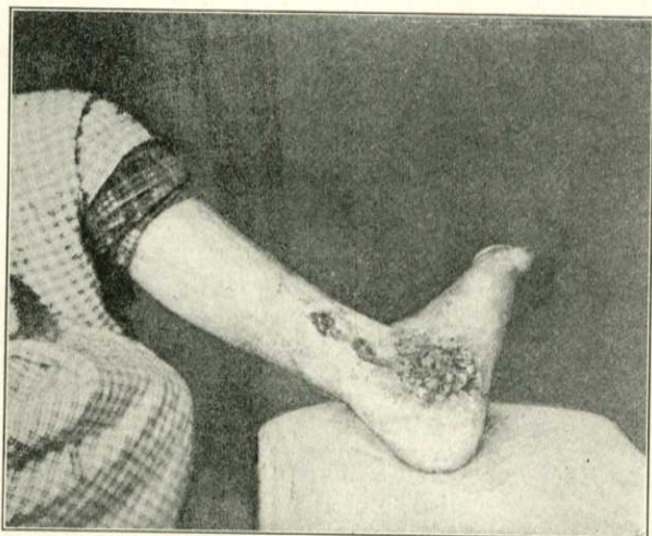
Fig. 52.—Marjolin's ulcer.

Marjolin's ulcer is an epithelioma arising from a chronic ulcer or an old cicatrix. The malignant change begins at some point of the edge of the ulcer, and its first evidence is induration. The induration spreads slowly and comes to involve a considerable part of or even the entire ulcer. Marjolin's ulcer is the seat of scalding, darting pain; the discharge is profuse, ichorous, and foul, and the floor of the ulcer is uneven, warty, or cauliflower-like. The anatomically related lymph-glands eventually become involved. This involvement is rarely early because induration has blocked lymph-channels. In order to confirm the diagnosis a bit of tissue should be removed and the removed piece must include a portion of the edge of the ulcer and of some