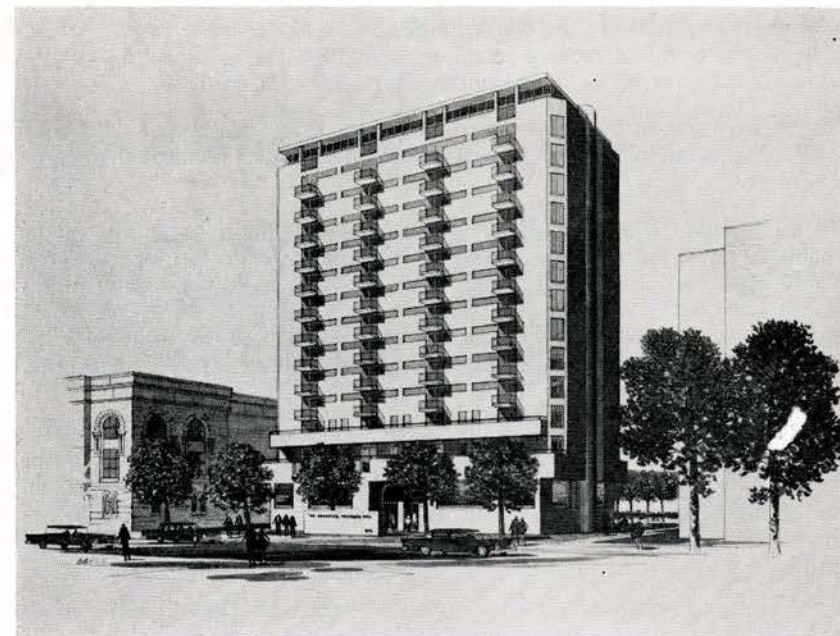
Artist's Concept of The Louis B. and Ida K. Orlowitz Residence Hall.