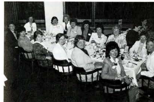
30th Anniversary Class of '57