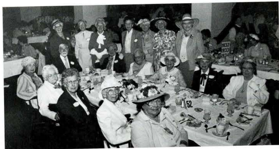
55th Anniversary Class of '32 (Note hats and gloves)