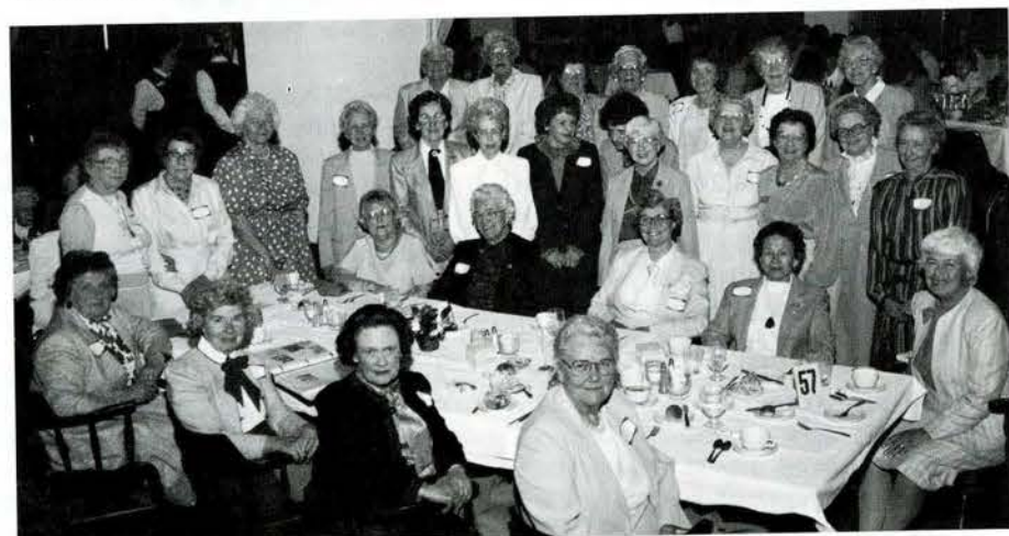
45th Anniversary Class of '42