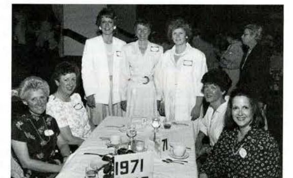
15th Anniversary Class of '72