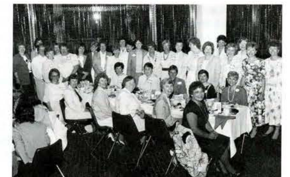
25th Anniversary Class of '62