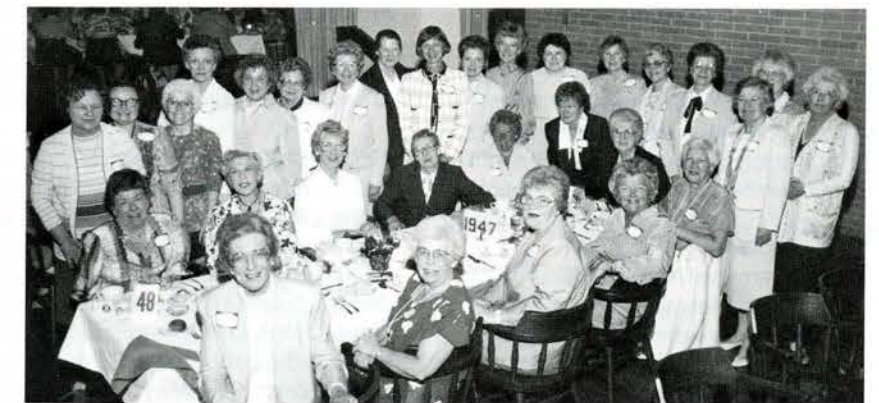
40th Anniversary Class of '47