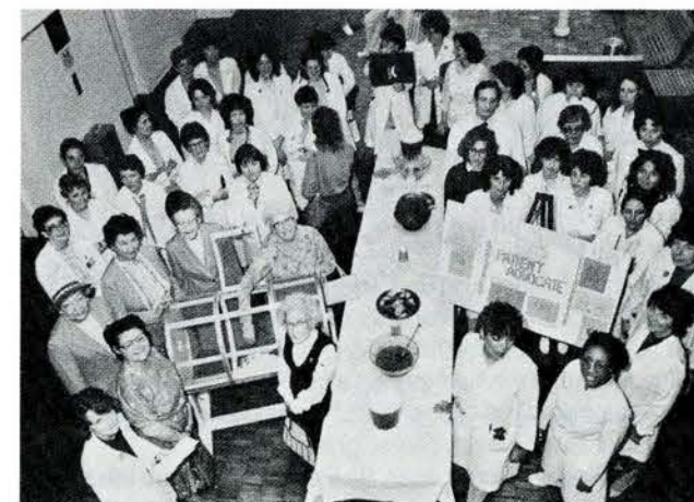
Celebrating National Nurses Day at Jefferson

Cumberland County School Nurses are proud of the schools they serve, they are proud to be part of the team that shapes the future of our youth, and they are proud of the stand they have taken against drugs in school, unless prescribed by a doctor.