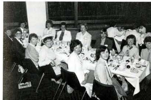
20th Anniversary Class of '67