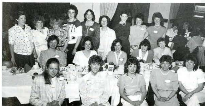
10th Anniversary Class of '77