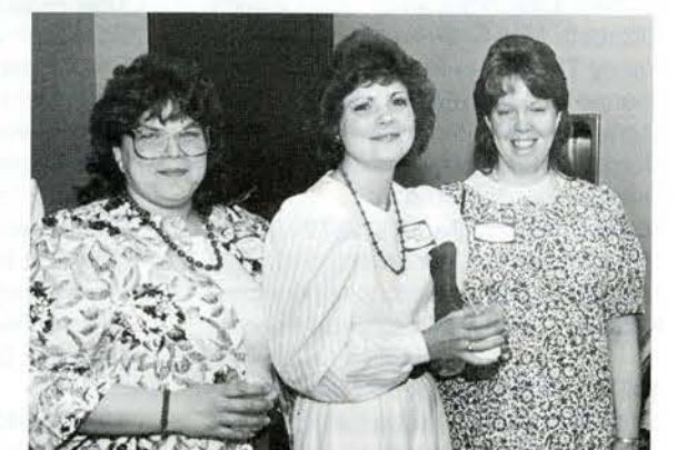
5th Anniversary Class of '82