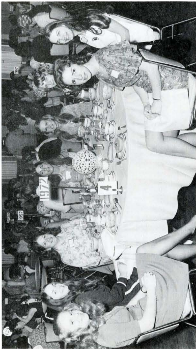
LUNCHEON CLASS OF 1972