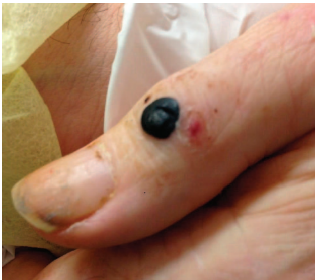
Figure 1. Hemorrhagic Bullous Dermatitis. Well-circumscribed, tense, nontender bullae with no significant surrounding erythema.