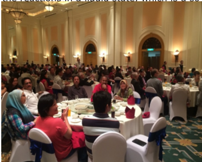
Figure 1: Participants at conference banquet.