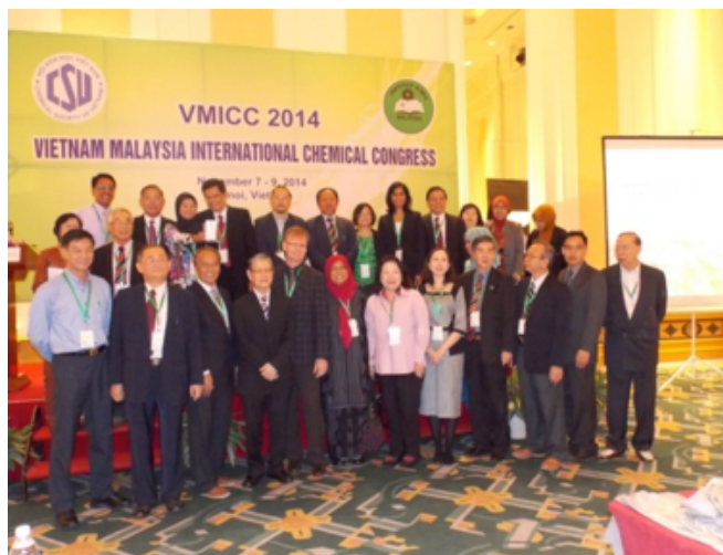
Figure 3: VMICC Joint organizing committees of IKM and CSV.