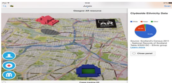
Figure 2: IPE in the City Experience

http://teamsscarlet.wordpress.com/2014/11/10/ar-in-the-city-its-finished/