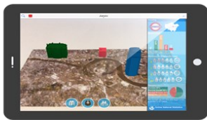
Figure 1: AR in the City

http://teamsscarlet.wordpress.com/2014/11/10/ar-in-the-city-its-finished/