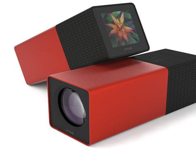
Figure 1. Lytro camera

Aim of the study: determine the utility of adapted digital light field photography in a resource-limited setting and establish best clinical practice for future KS monitoring via photography