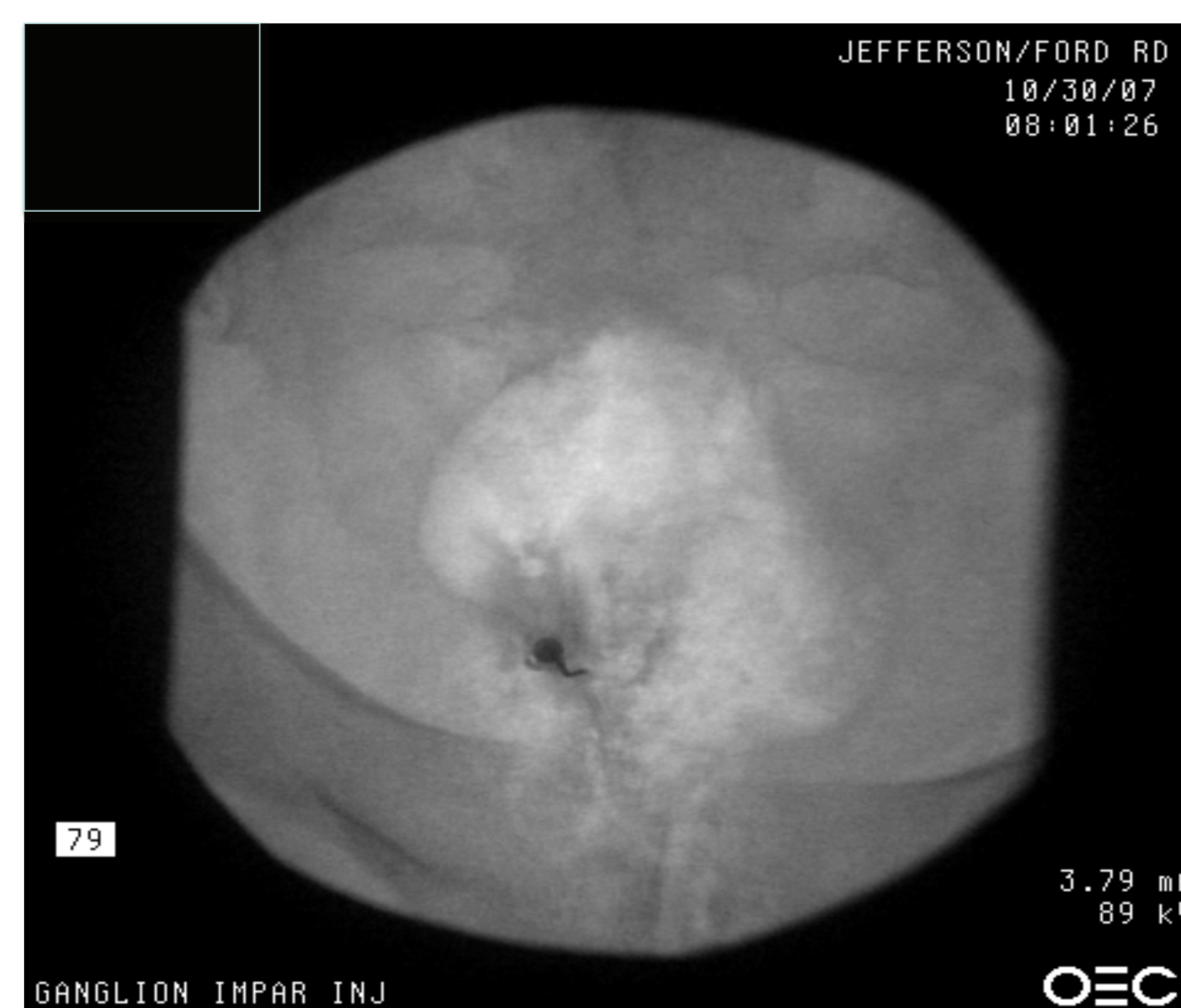
Fig. 1 – Trajectory view for a trans-sacrococcygeal approach

The outcome measures evaluated were overall pain level, functional improvements, and opioid medication usage. There was significant improvement in each case regards to the above outcome measures.