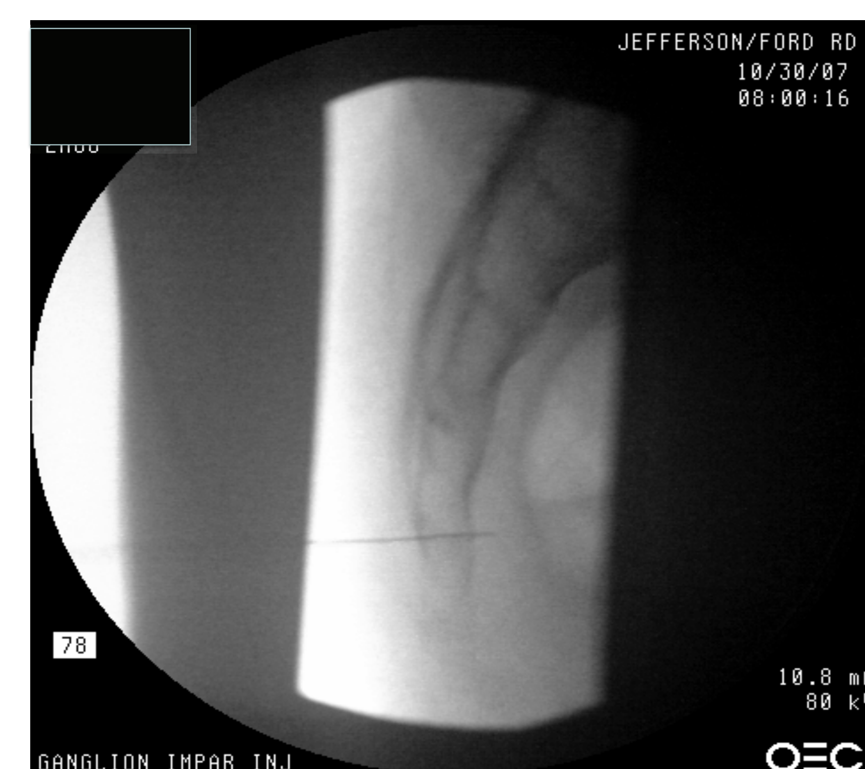
Fig. 2 – Lateral view for trans-sacrococcygeal approach with needle in place