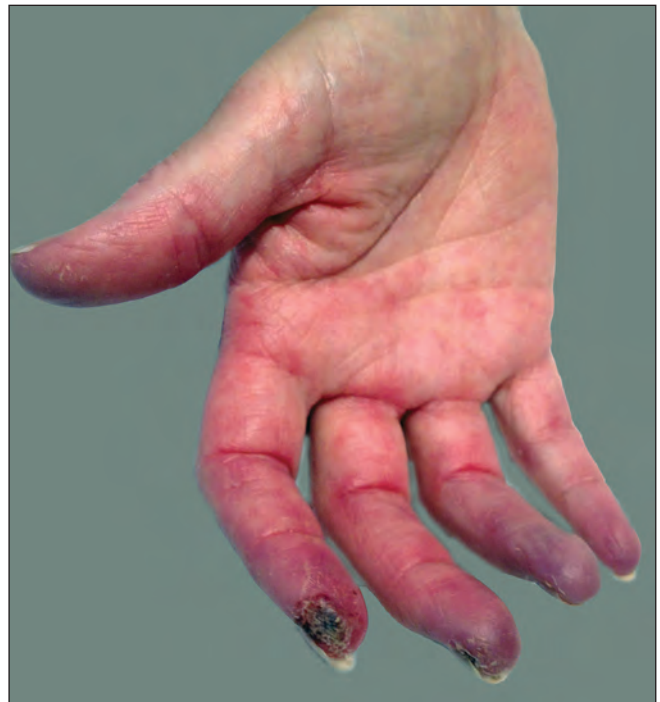
Figure 1. Right Hand Rash

Lab values revealed the following: C-Reactive Proteins 10.9 (H), Rheumatoid Factor: 16.9 (H), ANA (homogenous 1:160, speckled 1:160), Anti-Ro 8.0 (H), Anti-cardiolipin IgM 76 (H), Aldolase 11.7 (H). CA-125 118 (H) CA 15.3 (CA 27.29) 46 (H). Blood