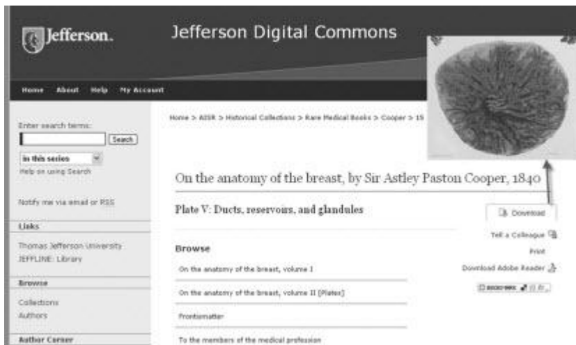
Figure 2: Sir Astley Paton Cooper’s On the Anatomy of the Breast

The Commons came with Jefferson’s dissertations already loaded. The Library then chose to digitize and post one of its rare books, Sir Astley Paston Cooper’s 1840 On the Anatomy of the Breast (see Figure 2), both because it is a unique resource that would generate a significant amount of traffic and because it is a beautiful and compelling piece to demonstrate during promotional visits to faculty. It functioned as a proof-of-concept work. From there, the Commons moved on to faculty postprints and original materials.