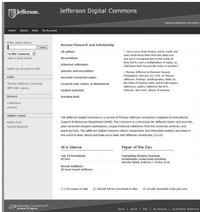
Figure 1: Jefferson Digital Commons home page

the new technology, and that significant efforts and time would be required to encourage their participation.