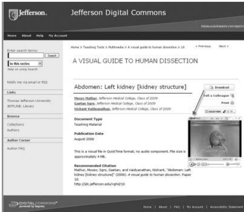
Figure 3: Multimedia Teaching Tools—a visual guide to human dissection