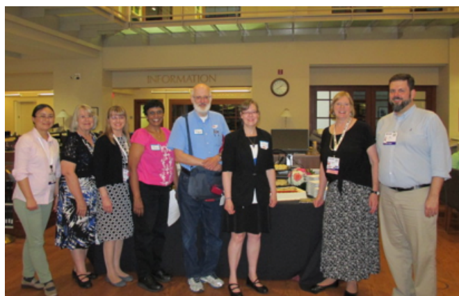
Past and Current Chairs of the Chemistry Division at the reception