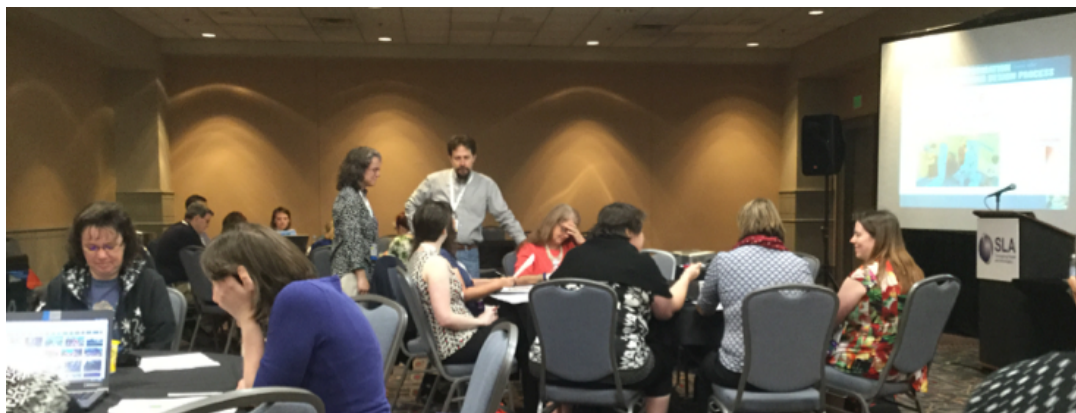
Integrating Information into the Engineering Design Process Session