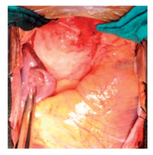
Figure 2. The milky-white plaque-like area on the ascending aorta.