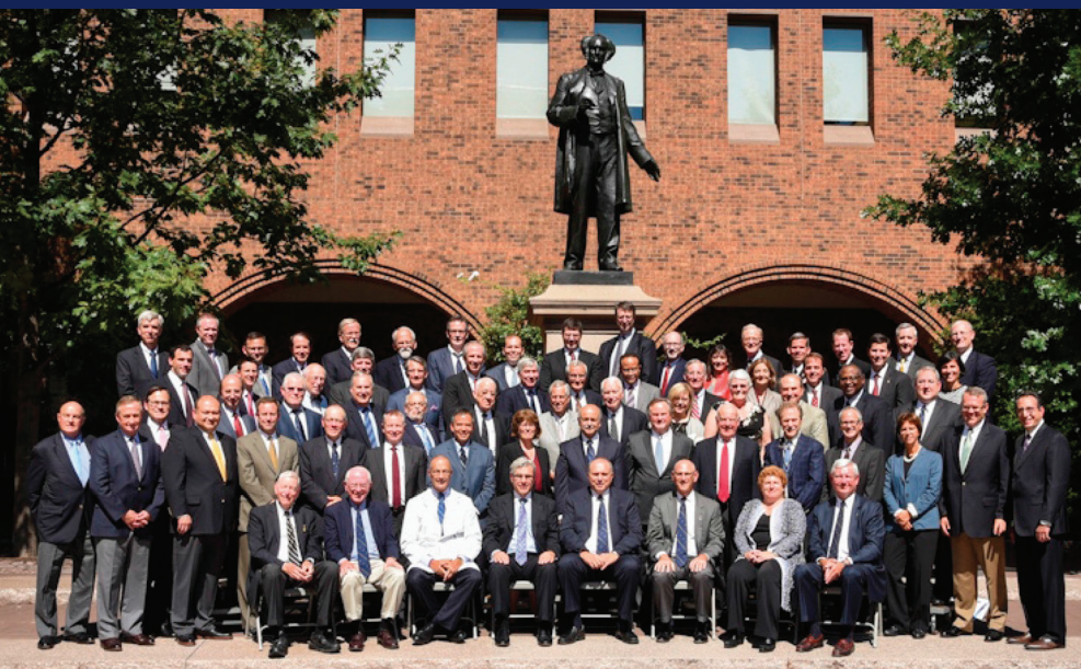
The Halsted Society in Lubert Plaza at Jefferson