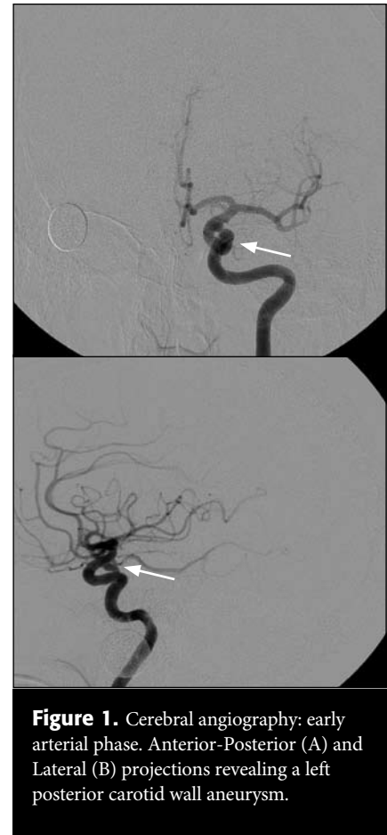
Figure 1. Cerebral angiography: early arterial phase. Anterior-Posterior (A) and Lateral (B) projections revealing a left posterior carotid wall aneurysm.

Use of self expanding Nitinol stents has revolutionized the treatment of intracranial aneurysms as well as intracranial atherosclerotic disease. MRI/A have been shown to be of great value in evaluating restenosis of a treated vessel or recanalization of treated aneurysms where these stents have been utilized. A multitude of reports in the English literature have revealed that MRI/A creates minimal