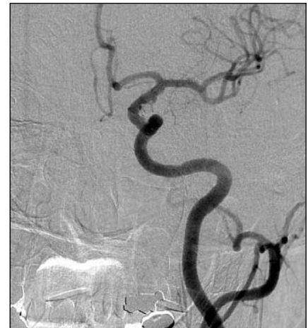
Figure 5. Cerebral angiography: left common carotid artery injection early arterial phase. AP (A) and Lateral (B) projections revealing no evidence of carotid dissection at the site of Neuroform stent placement.

Neuroform-3 stents can create MRI associated artifact/signal drop out and such this should be taken into account when imaging vessels which house such stents. While MRA with gadolinium or CTA head can better visualize the pathology, cerebral angiography remains the gold standard in evaluating vessels which have undergone stenting.