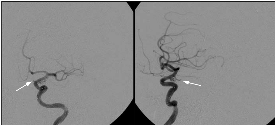
Figure 2. Left ICA injection: early arterial phase. AP (A) and Lateral (B) projections post Neuroform stent placement and coil embolization of the posterior carotid wall aneurysm.