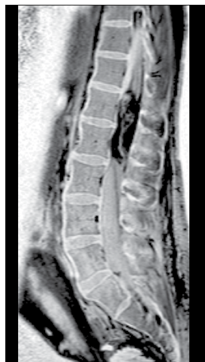
Figure 1. Sagittal T1 Lumbar Spine MR Imaging post gadolinium reveals an enhancing mass at the T12 - L1 spinal levels with heterogeneous but intense enhancement of the lesion and an irregular central foci of nonenhancement. The lesion fills the spinal canal, and appears to arise from the terminal portion of the spinal cord.

A 27-year-old gravida 1, para 0 patient underwent a Caesarean section with epidural anesthesia without difficulty. She was discharged home with a healthy infant on post operative day two. Three days after the procedure the patient noted a moderate degree of low back pain, which was initially attributed to ligamentous strain. Conservatively therapy, consisting of bed rest and analgesics, failed to provide symptomatic relief. The symptoms persisted and the patient progressed over the following three weeks, noting worsening low back pain radiating to the legs. The patient then presented to the emergency department, where she described severe low back pain radiating into both lower extremities. Her past medical history was insignificant. She denied any history of coagulopathy, heavy menses or any contributory family history. A thorough neurological exam revealed intact motor strength sensation, with normal deep tendon reflexes and an absent Babinski's sign. A rectal exam revealed normal anal sphincter tone and volition.