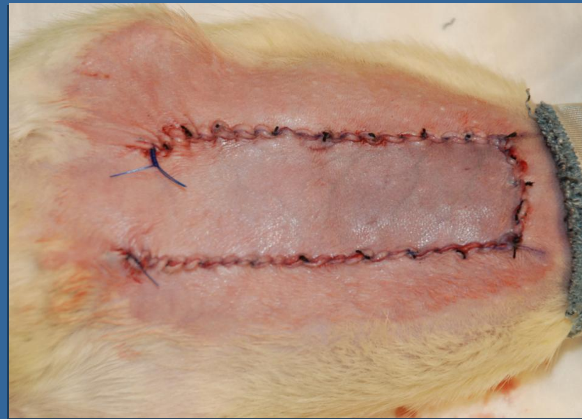
Figure 1: Abdominal skin flap

Twenty male Sprague-Dawley rats (avg. 450 g) underwent surgery to create a rectangular skin flap (3 x 9 cm) based off of the inferior epigastric artery. The flap was sutured in place with buried interrupted 3-0 Vicryl sutures and a running 3-0 nylon (Figure 1).