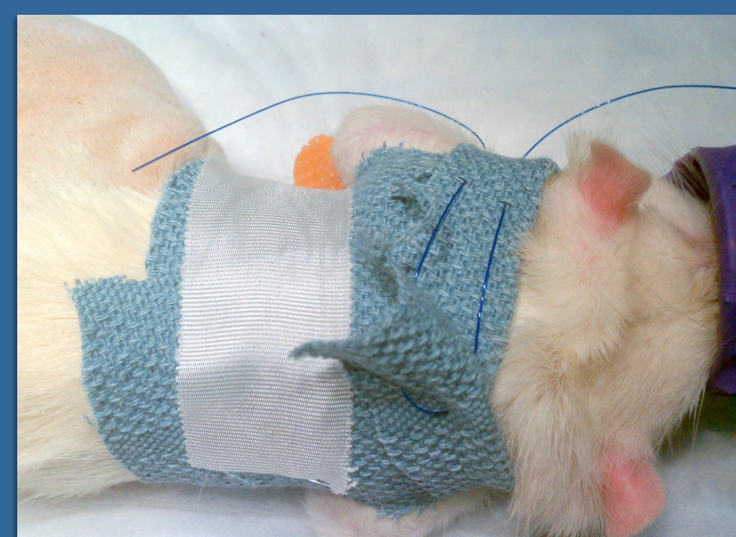
Figure 3: A suture fixes the vest collar

Commercially produced protective rat vests do not necessarily conform to the specifications needed for the surgical site, and are expensive ($40 a vest). One sheet of thermoplastic material, provides sufficient material for over 40 animals, and can be purchased for less than $100. We found that each vest requires about 10 minutes to construct and to apply to each animal.