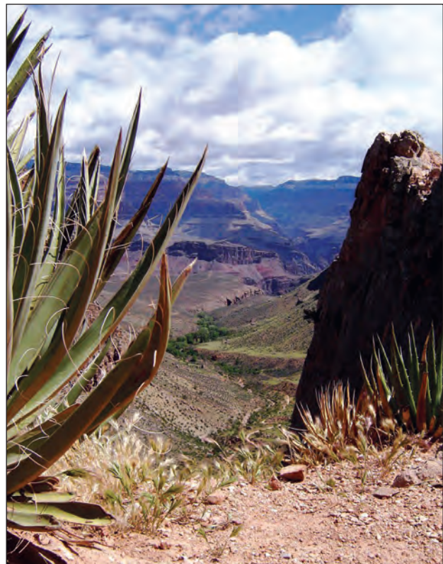
“The Grand Canyon”