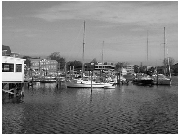
[Insert Image: Eel pond with Swope dormitory in the Distance (building on right)]