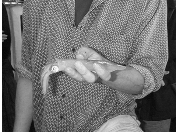
[Insert image: Tour of the Marine Biological Laboratory-Viewing a squid (Ioligo)]