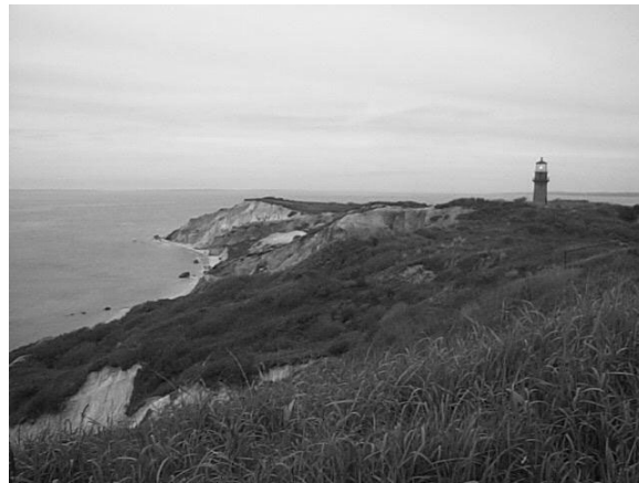
[insert image: Gays Head lighthouse and cliff on Martha's Vineyard]