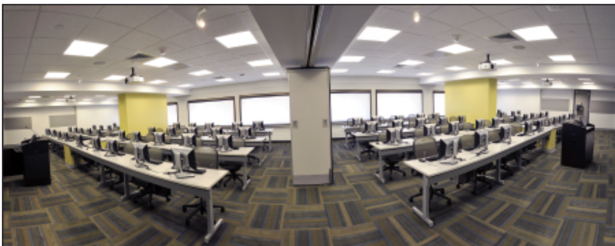
Two new 40-seat classrooms in Jefferson Alumni Hall

For more information about Learning Resources, visit our website at: jeffline.jefferson.edu/LR