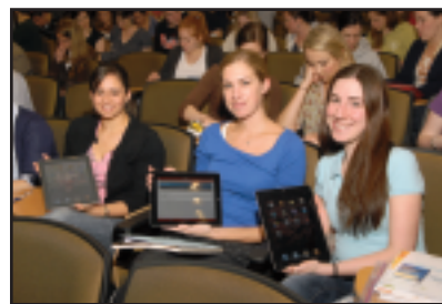
JSN iPad distribution and orientation

The Scott Library Circulation Desk has wireless keyboards and connectable large monitors available for individual and group study. The Circulation Desk will also provide wireless printing directly from the iPad. A special