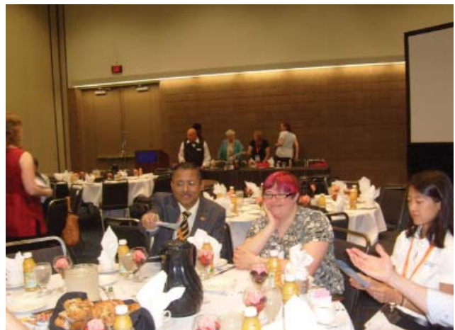
Science-Technology Division Business and Awards Breakfast at the Convention Center

For the first time, I had the chance to attend the Science-Technology Division breakfast session at 08:00 am in the morning. I have never experienced such a wonderful division in my life. There is so much warmth and affection among the people. As I was representing my parent organization TERI, I first distributed the institute's and LIC brochures. The members of the Sci-Technology division showed keen interest in our institute's work profile, because TERI is working in the field of energy, environment,