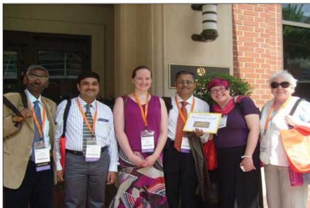
Newcomers are anxiously waiting to assemble and proceed to the lunch

All the newcomers to the Science-Technology Division were invited to a lavish lunch in one of the renowned French Quarter restaurants in New Orleans. Thanks to the Science-Technology Division for offering such palatable, lavish lunch and drink to us.