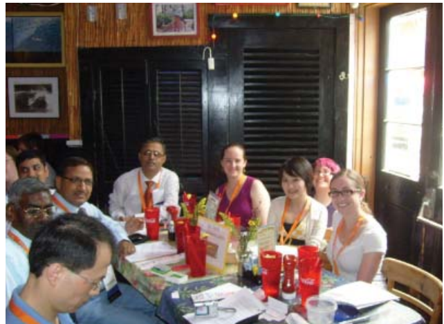
New members of the Science-Technology Division at lunch