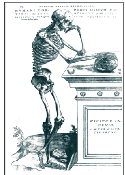
Andreas Vesalius De Humani Corporis Fabrica. Libri Septem. Basel, 1543

Most of the Archives' photographs have been digitized and are available on JEFFLINE through PHDIL (Philadelphia Historical Database Image Library). For more information: http://jeffline.tju.edu/archives/phdil/