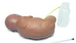
Infant Lumbar Puncture Simulator Baby Staph provides an opportunity to practice lumbar puncture on an infant with synthetic spinal fluid return.