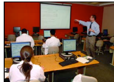
Most AISR workshops are held in the Scott Library Learning Resources Center, Room 306

Each Fall and Spring, AISR conducts a variety of workshops for Jefferson faculty, staff, and students. Below are just a few of the workshops we offer in the areas of Information Searching Skills and Instructional Technology . Look for an AISR Workshops brochure in your mail every August and December. For complete schedules and online registration, go to: http://jeffline.jefferson.edu/workshops.html