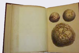
On the Anatomy of the Breast (1840) [overview of open book]

As an initial component of the Jefferson Digital Commons, what was once a scarce book, too fragile to handle, and requiring a trip to a rare book reading room, is now accessible to a world-wide audience.