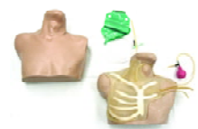
Central Line Simulator The central line simulator features carotid pulse and a flashback of synthetic blood upon correct placement of the central line.

For more information on Simulation Technology, contact: