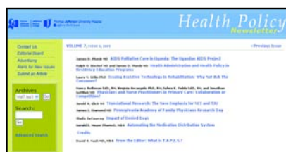
The JDC provides a home for Jefferson electronic publications, such as Health Policy Newsletter.

Look for Scopus under "Core Resources" on the JEFFLINE homepage at: http://jeffline.jefferson.edu/