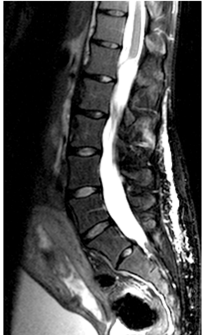
Fig. (2). Sagittal T2 Lumbar Spine MR Imaging reveals an oblong intradural mass 6.1 x 1.9 x 1.7 cm in the craniocaudal, transverse, and anteroposterior dimensions. Bright imaging CSF appears above and below the lesion. Again, the lesion appears to begin at the terminal portion of the spinal cord.

account for roughly 30% of spinal cord neoplasms while intradural extramedullary tumors are responsible for approximately 40 to 50% [4]. Intradural spinal cord tumors are uncommon with an incidence of about 3-10 per 100,000 individuals. These tumors occur predominately in the third and fourth decades of life [9]. The most common extramedullary spinal cord tumors are nerve sheath tumors, meningiomas and filum terminale ependymomas. Ependymomas are the most common gliomas of the lower cord, conus and filum