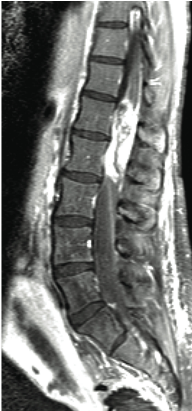
Fig. (1). Sagittal T1 Lumbar Spine MR Imaging post gadolinium reveals an enhancing mass at the T12 - L1 spinal levels with heterogeneous but intense enhancement of the lesion and an irregular central foci of nonenhancement. The lesion fills the spinal canal, and appears to arise from the terminal portion of the spinal cord.

account for roughly 30% of spinal cord neoplasms while intradural extramedullary tumors are responsible for approximately 40 to 50% [4]. Intradural spinal cord tumors are uncommon with an incidence of about 3-10 per 100,000 individuals. These tumors occur predominately in the third and fourth decades of life [9]. The most common extramedullary spinal cord tumors are nerve sheath tumors, meningiomas and filum terminale ependymomas. Ependymomas are the most common gliomas of the lower cord, conus and filum