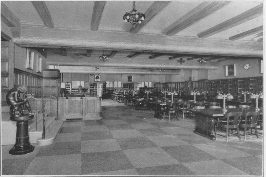
Reading Room of the Library