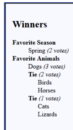
Fig. 4. Displaying winners (including ties)