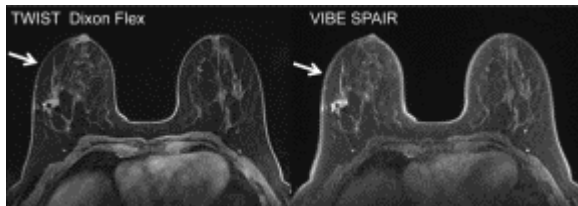
Figure 3. Comparison between TWIST-Dixon-Flex image at the peak enhancement, and VIBE-SPAIR image in the end of the scan, in the same patient. Note the obvious ringing artifact at the surface of the tissue in the VIBE-SPAIR image (arrow), in TWIST-Dixon-Flex image, there is much less of such artifact.

tumor (known invasive ductal carcinoma) with typical increasing background enhancement. In the maximum slope color map overlay (i), red color represents voxels with enhancement slope greater than 6% per second, while green color represents slope less than 6%. Although 'green' voxels labeled by arrows 2 and 3 both have similar maximum slope, their overall enhancement types are different. Different voxels also reach peak enhancement at different time points: voxel 1 peaks at the 7 th time point (j), while voxel 2 peaks at the 9 th time point (k), and voxel 3 continues to be increasingly enhanced during the whole process (l).