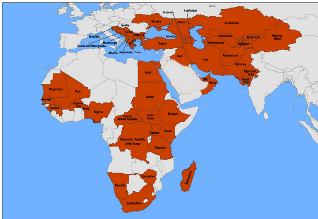
CRIMEAN-CONGO HEMORRHAGIC FEVER DISTRIBUTION MAP

Animals play a critical role in the life cycle of CCHFV, with amplification of the virus before transmission to humans by ticks. Most animals infected with CCHFV do not display signs of clinical disease and CCHFV infection has been detected in a wide range of wild and domestic mammals. 11,12 Viremia in mammals can last for up to two weeks with no clinical signs, 13 and different serological prevalence rates have been reported in livestock in various countries (Egypt, Iran, Kosova, Niger, Saudi Arabia, Sudan, Turkey) i.e. 0.6% to 79% in cattle, 3.7% to 85.7% in sheep and 3.2% to 66.6% in goats. 14–24