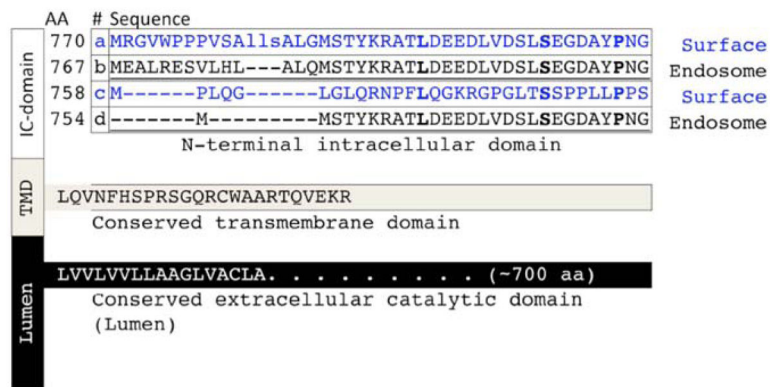
Fig. 3. Sequence variants of endothelin converting enzyme ECE-1 is a type-II membrane protein with a variable N-terminal intracellular (IC) domain, and conserved transmembrane (TMD) and extracellular (Lumen) domains [153]. Through multiple alternate promoters, at least four isoforms of ECE-1 have been identified, each with unique intracellular domains that determine subcellular localization and tissue distribution, Isoforms 1a and 1c are primarily localized in the plasma membrane, whereas isoform 1b and 1d are predominantly located in late endosomes/multivesicular bodies and recycling endosomes, respectively [70, 119, 154].