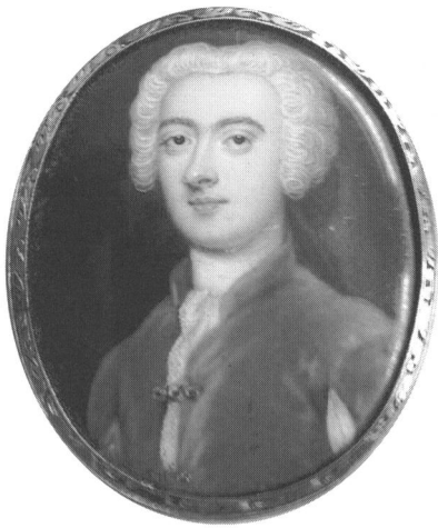
4 Sir James Gray , by an unknown artist, c.1730-2. Enamel on metal. Private collection