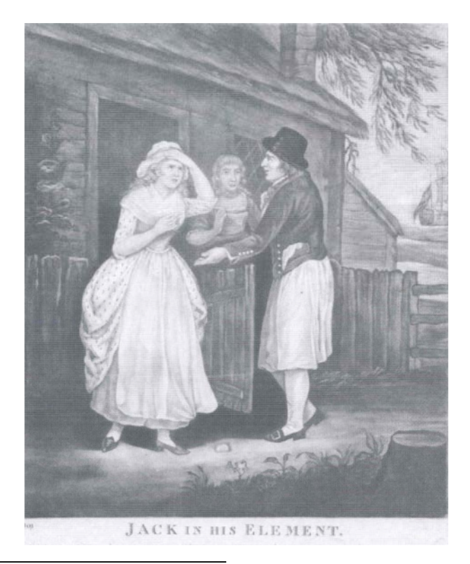
FIGURE 1 Jack in His Element. London: Robert Sawyer and Co., 17 June 1793.

Land's choice of the term, "extravagant" is apt as nothing drew more comment from contemporaries than sailor dress. Beginning in 1748 there was an official naval uniform but only for officers and midshipmen.<sup>76</sup> Warrant officers wore plain blue coats to distinguish themselves from the ratings. In the absence of an official designated uniform, sailors developed their own informal uniform (see Figure 1). Called "short clothes" as opposed to the landsmen's "long clothes," they were both functional (short so they would not catch in the rigging) and a clear visual marker of occupation. While on the ship, sailors wore loose breeches made of canvas, short blue jackets, red waistcoats, checked shirts, and scarves or handkerchiefs around the neck.