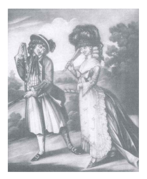
FIGURE 2 Jack Oakham throwing out a Signal for Engagement. London: R. Sayer & J. Bennett, 27 July 1781.

Featuring a sailor flirting with a woman, the 1781 print entitled Jack Oakham throwing out a Signal for Engagement (Figure 2) falls into the libertine group.