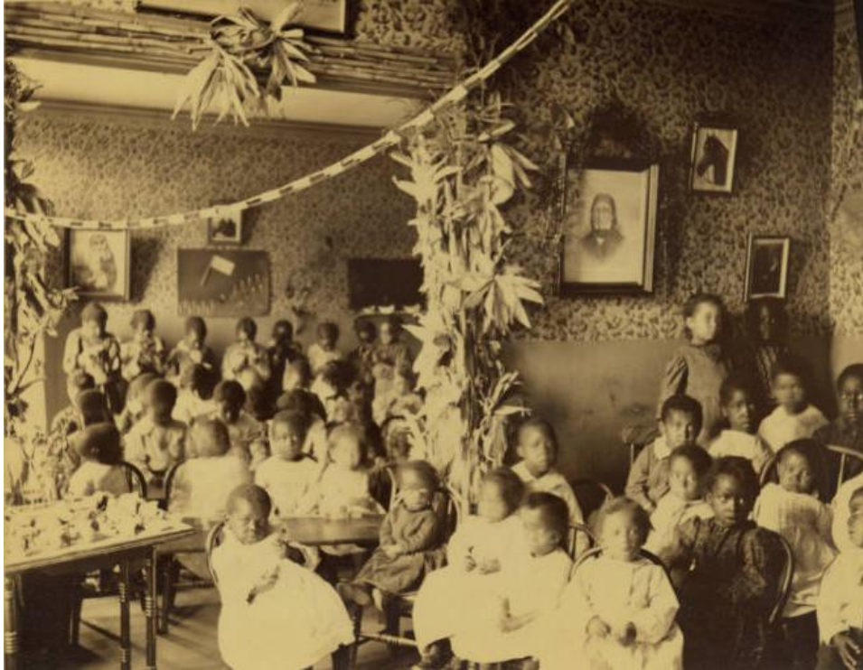
A group of students at the Rhode Island Street Kindergarten in their classroom, decorated for the fall season.