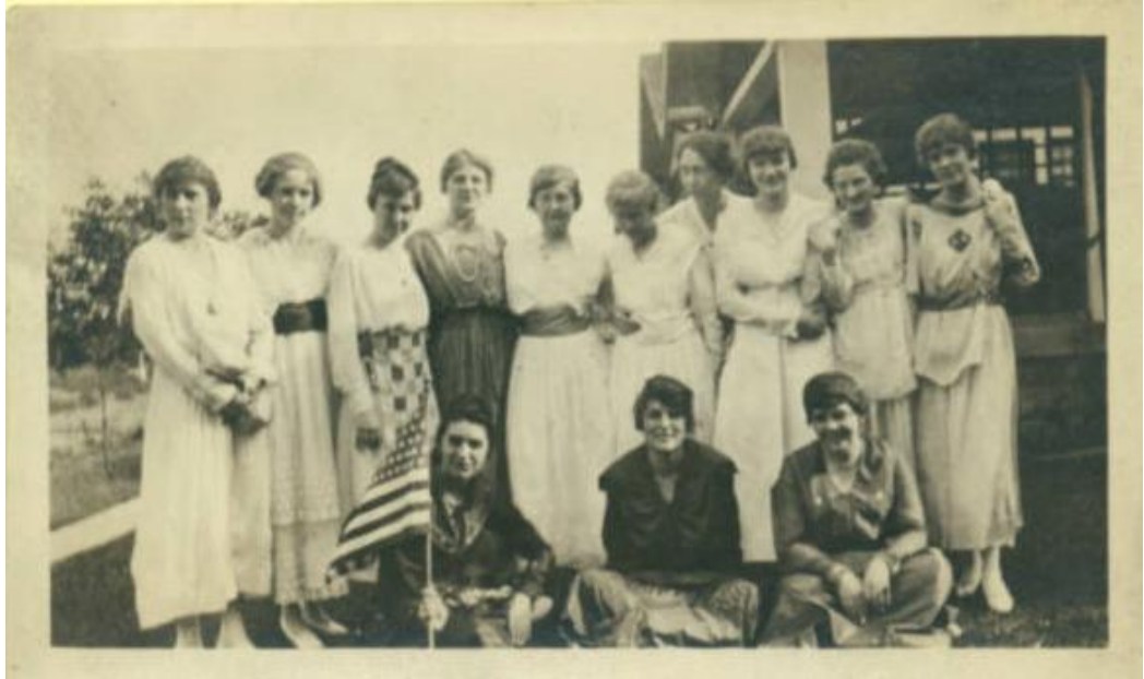
A group of students of the Teachers College of Indianapolis, circa 1913-1917.