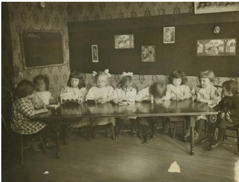
A group of Russian, Austrian, and Hungarian children enrolled in the Indianapolis Free Kindergartens, October 1914.