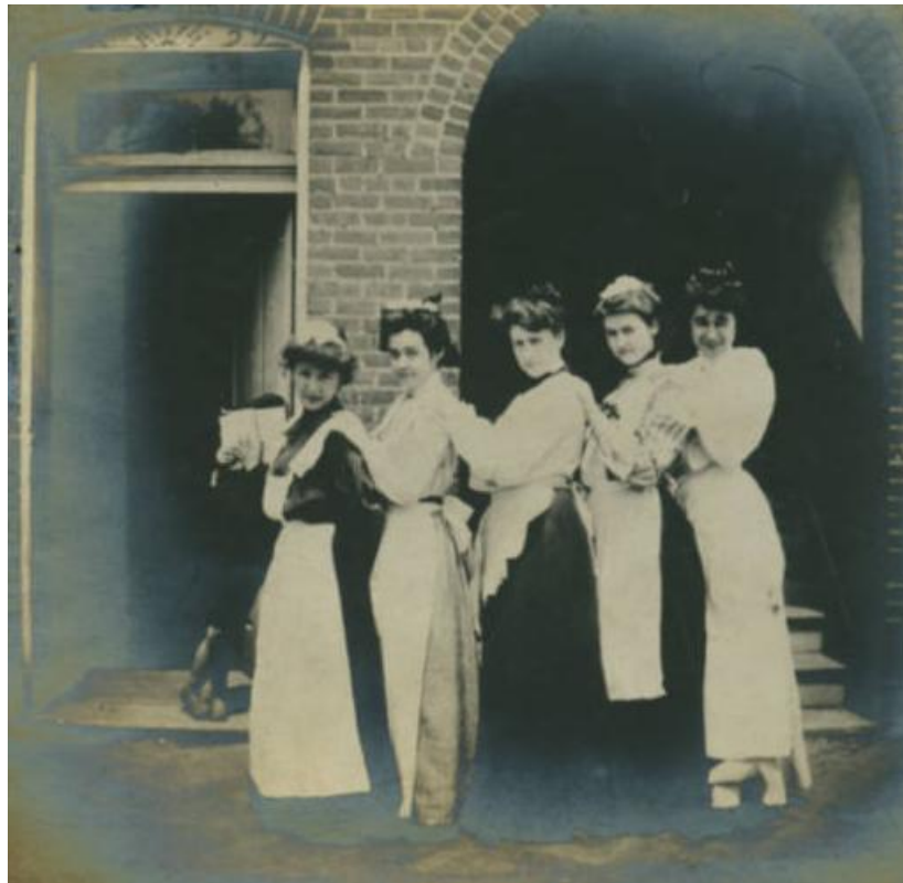
A group of five teachers of the Indianapolis Free Kindergartens, circa 1895-1905.