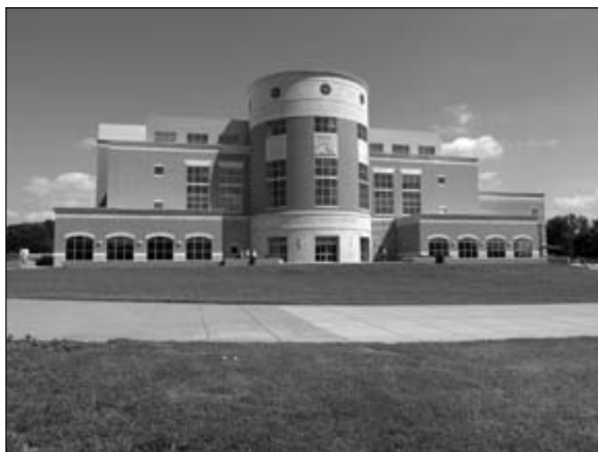
New building exterior, daytime

There are thousands of decisions, large and small, to be made in planning a new building — from the overall environment and ambience desired to the amount, location, and type of space allocated to staff versus that given to public areas, from shelved collections to public service desks to types and variety of