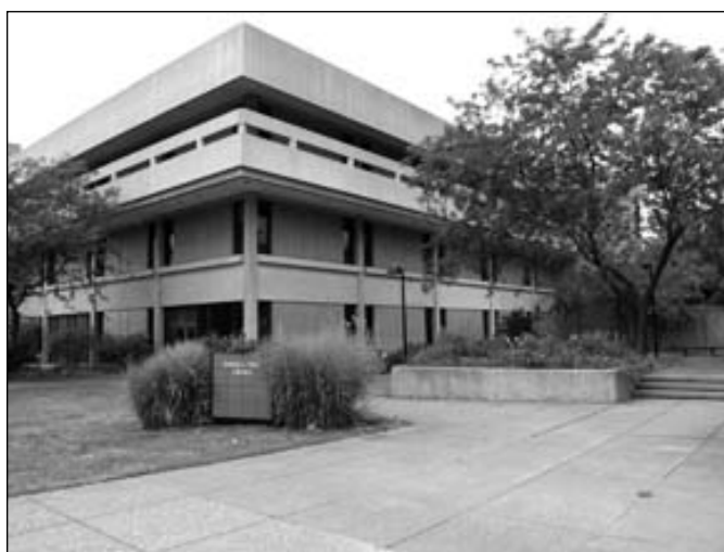
Original library building, opened in 1971