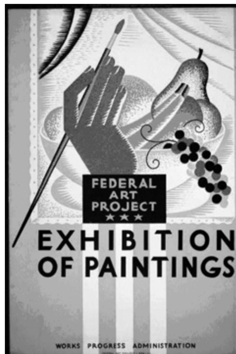
"Exhibition of Paintings." Ill. : Federal Art Project, WPA, [between 1936 and 1941], in By the People, For the People : Poster From the WPA, 1936-1943. Digital ID: http://hdl.loc.gov/loc.pnp/cph.3b49490

An outstanding example of government posters are those published by the U.S. Works Projects Administration (WPA) by the Library of Congress in its digital online library, American Memory Over 900 posters are digitally reproduced from the American depression-era,