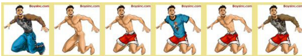
Figure 2. Deno’s animated user icon, all frames in sequence.

The clearest example of Deno’s public queer identity in his blog, however, is not in the text but in the visual representation of his orientation that he establishes with his user icons. Three of these icons are queer-specific, one of which being an animated icon that morphs into a naked young man briefly before re-clothing him (see Figure 2).