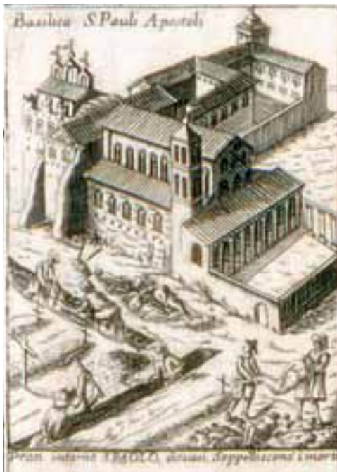
Black Death Plagued Medieval Europe

Smallpox, which is caused by a variola virus, was described in ancient Egyptian and Chinese writings. According to some researchers, over the centuries smallpox was responsible for more