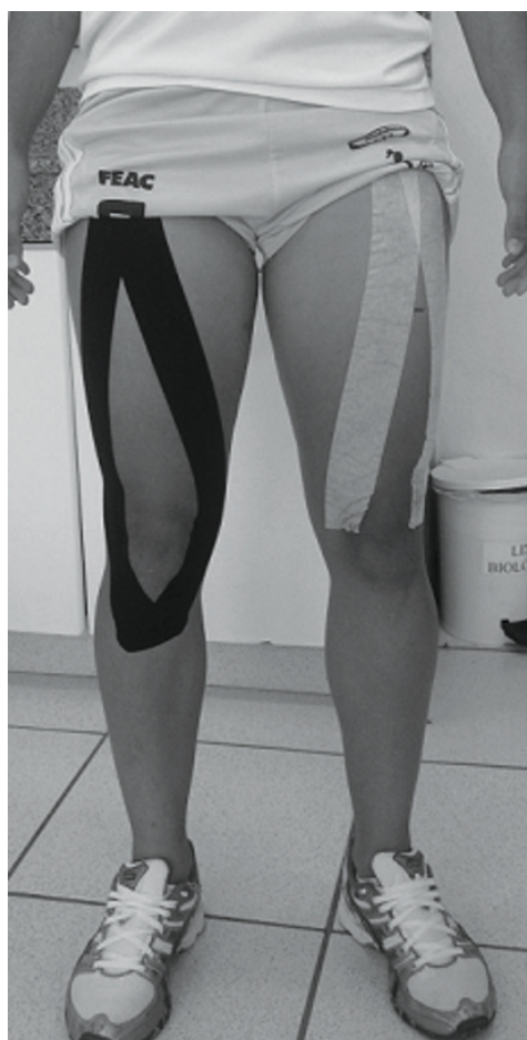
Figure 2. Application of Kinesio Tape (right lower limb) and 3M Micropore ® (left lower limb).

applied on the contralateral limb. First, the sites of tape placement were shaved and cleaned with 70% rubbing alcohol. The tapes were randomly placed on the right and left lower limbs over the quadriceps muscle. Therefore, both limbs were taped, one side with Micropore and the other with KT in random order among participants. Half of the participants (n=17) had KT applied to the left thigh and the other half to the right thigh (n=17). KT was applied using the "V" technique, the knee was positioned at 45° of flexion, the origin of both tapes was located 10 cm below the anterior-superior iliac spine with one tape going laterally and one medially to the rectus femoris muscle belly, passing around the patella and finishing on the tibial tuberosity 22,23 . The same technique was used for the Micropore tape on the contralateral limb, but because it is not elastic, the knee joint was not crossed and the end points were the medial and lateral aspects of the patella (Figure 2). After the final testing session the tapes were removed and the skin was cleaned with rubbing alcohol.