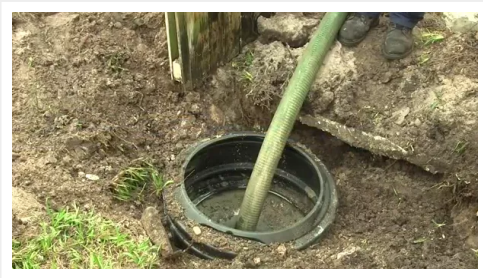
Workers suck sewage from a Miami Gardens septic tank.

But in Miami-Dade County, anything that has to do with water – and wastewater – isn't just “another business.” Theirs is one that deals with immediacy and can have a real impact on the health of neighborhoods, as septic tanks are used to dispose of wastewater from toilets and “graywater,” water that comes from people's showers and dishwashers.