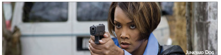
Vivica A. Fox stars in her upcoming film, Junkyard Dog , which premeieres on April 2 at the festival.