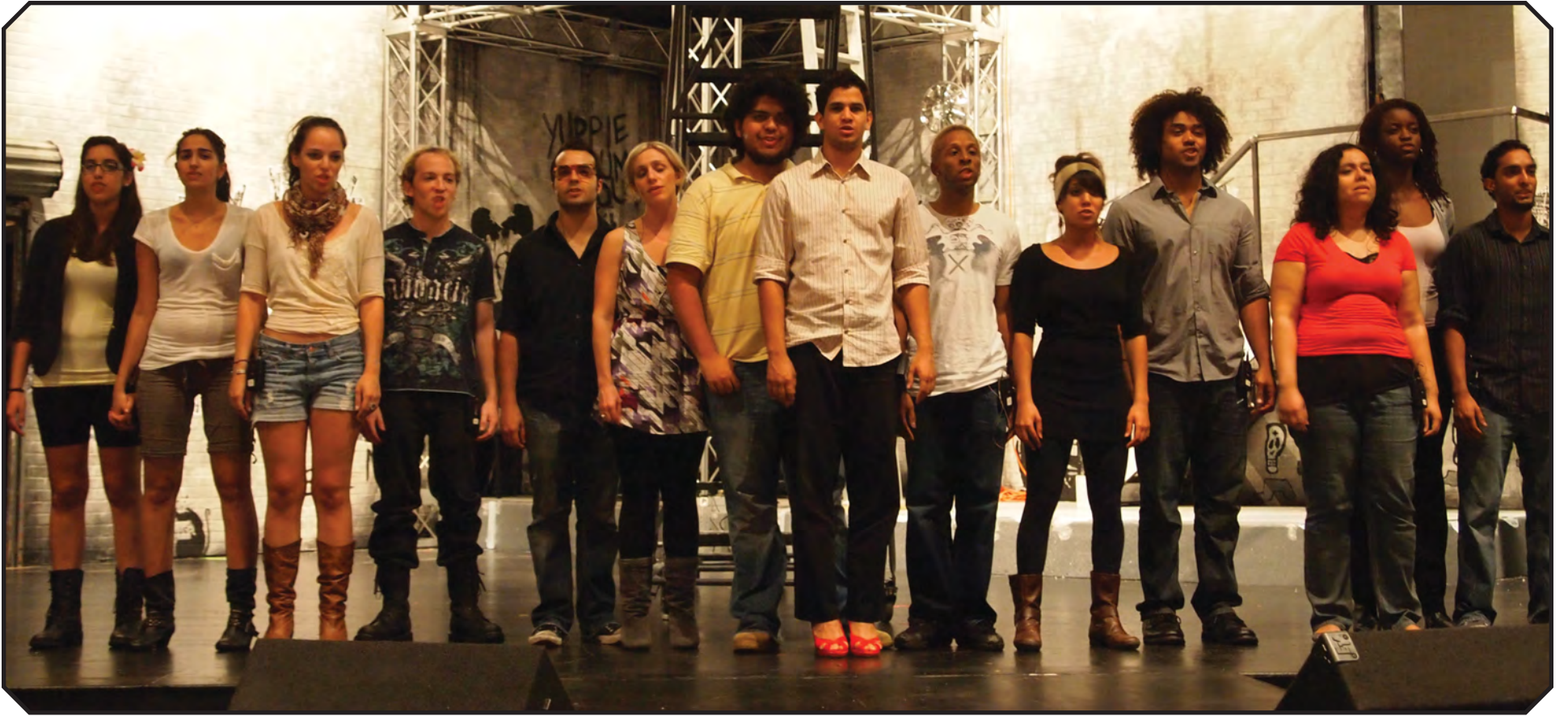
The cast of Rent during Crew View rehearsals on Oct. 28.